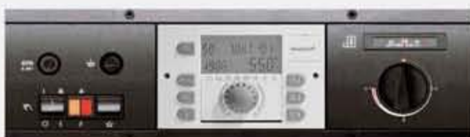
POM series automatic eco control panel

Thermix is a system designed by Pratikel . With tightening cross sectioned design and with turbulence wings , adaptor gives high speed to the return water of the boiler. Hot boiler water in the back sections of the boiler can be transferred to the front sections with the help of this turbulanced high speed water. With this way , hot water mixes with cold return water of boiler and temperature of return water increase .As temperature of the water which goes to back side of the boiler rises, condensing is prevented.